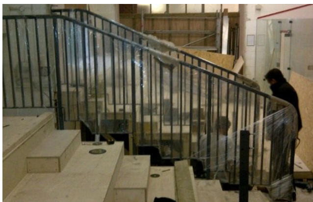
Hallamshire T&SC - Squash court construction